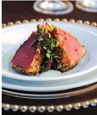
The rich red and ivory place settings, along with invitations trimmed with red and gold satin ribbon suggest a hint of romance and were provided by Annabelle's. The menu presents a sampling of delicacies that include cold seared sesame tuna served with cucumber salad, and herb marinated Frenched chicken breasts that are pan roasted and served on a bed of citrus couscous with roasted tomatoes.