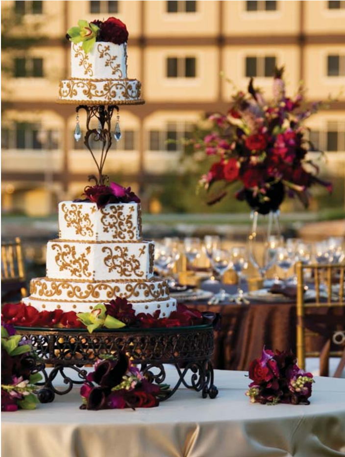
The bride's cake table is fashioned in gold lamour linen, pin-tucked over an espresso bengaline cloth provided by BBJ Linen. Icing Illusions created the exquisite six-tier cake.